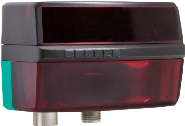
R2300 Multi-Layer Scanner

The R2300 outputs the data for angle, distance, and reflectivity with the associated timestamp. The data is transmitted via the Ethernet interface of the sensor, allowing the data to be accessed by a large number of automation systems. In the foreseeable future, the R2300 will become available in a switching version and will offer additional connection options that can be integrated in a simple and cost-effective manner via the flexible interface module.