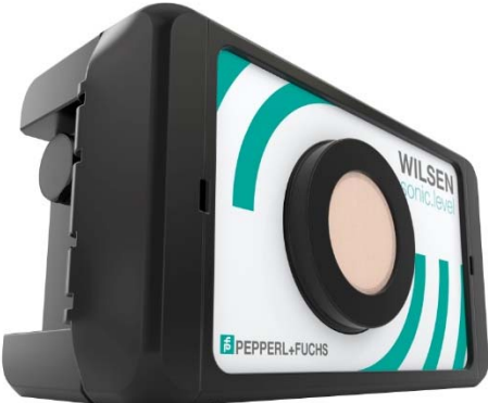
IoT sensor WILSEN.sonic.level

IoT sensors and a structured roll-out for software updates to ensure that even large numbers of IoT sensors in the field are kept up to date. The WILSEN concept provides a modular IoT system to which individual components such as sensor modules, network nodes, middleware, and data processing can be added.