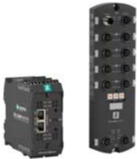
Figure 1: IO-Link master with OPC UA interface

4.0 as detailed data can be collected from the lowest field level and evaluated in a target-oriented manner.