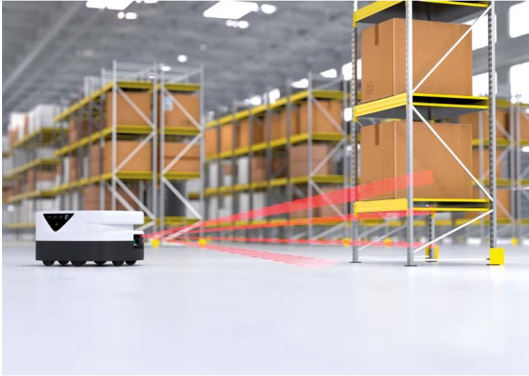
Reliable collision avoidance and navigation support for small AGVs/bots